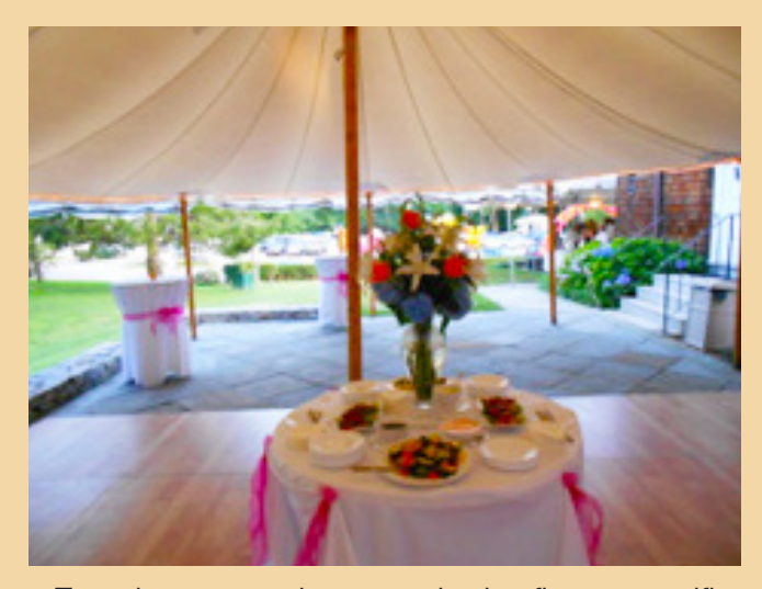
Tented events can be customized to fit your specific needs and will exceed your expectations